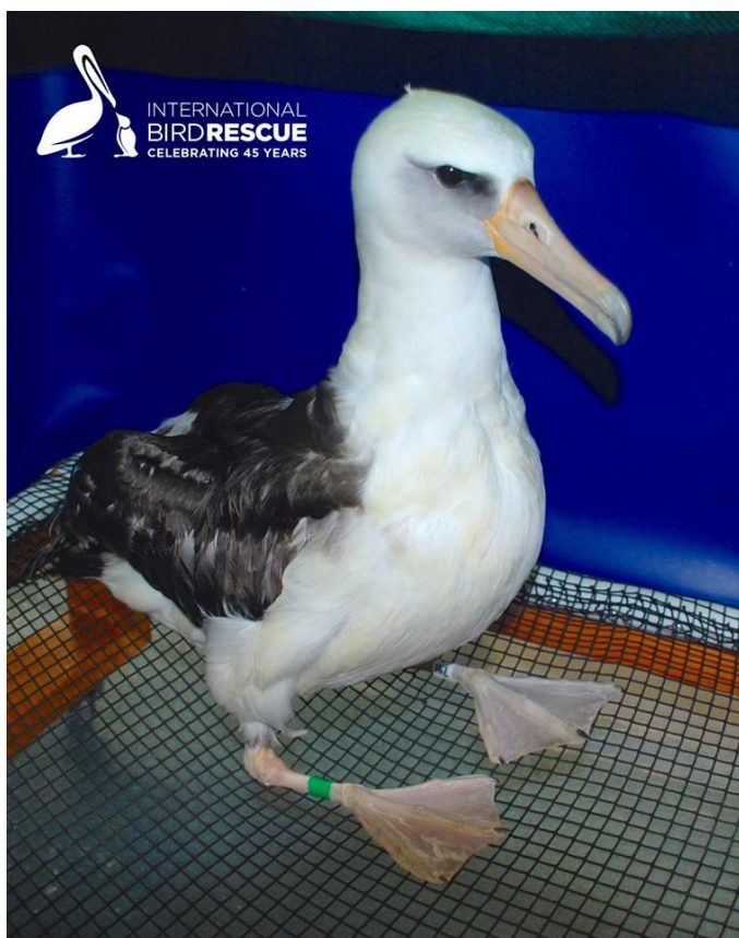
Photo 4: Laysan albatross in drying cage following wash to remove oil

The specifications of the netting that Bird Rescue uses for the net-bottomed pens are at least 1/4" up to ½" knotless nylon netting. This size will stop small birds falling through and evenly distribute the weight of small and medium sized birds (grebe, duck). The photo below of an albatross also demonstrates the diameter of the mesh required.