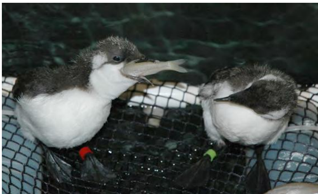
Photo 3: Bird Rescue image: Common murres feeding on net-bottomed cage insert