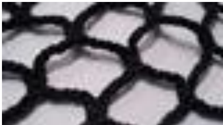
Photo 5: Example netting ( \frac{1}{4} " – \frac{1}{2} " )

Contact International Bird Rescue for further information: https://www.bird-rescue.org/